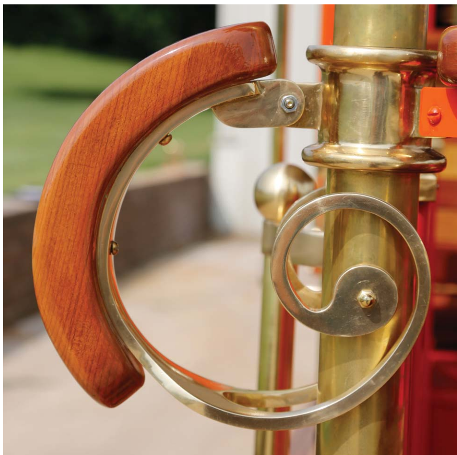
Custom-designed hand grab