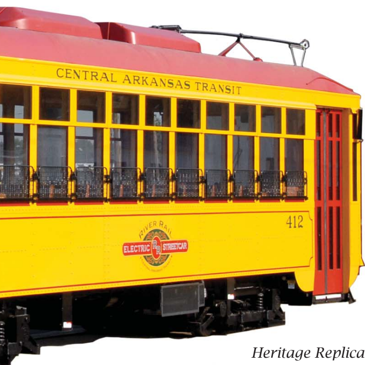
Heritage Replica Birney Trolley

Gomaco can provide you with trolley manufacturing and engineering consultation on restoration or renovation of existing trolley cars or in the manufacturing of new trolley cars.