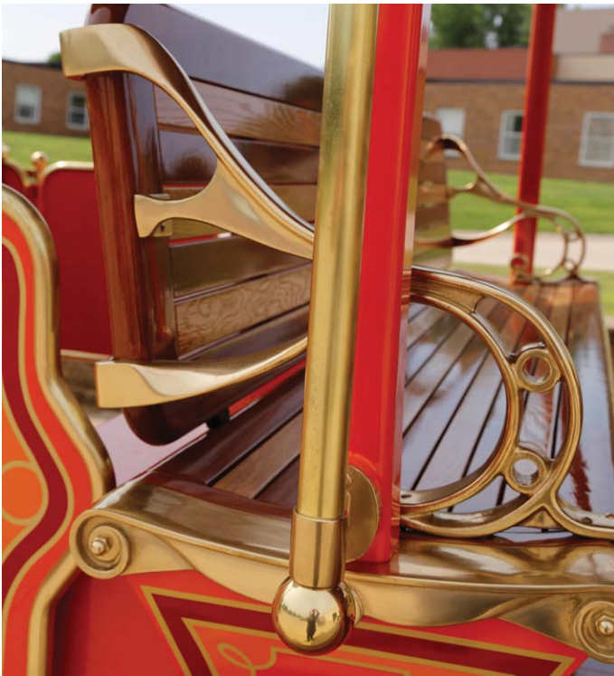
Ornate custom-built brass pieces

If you need to restore or renovate a trolley, or if you are a collector of trolley memorabilia, you can order any one of hundreds of single parts or a complete trolley assembly. Gomaco can provide you with mechanical and electrical assemblies as well as various pneumatic circuitry.