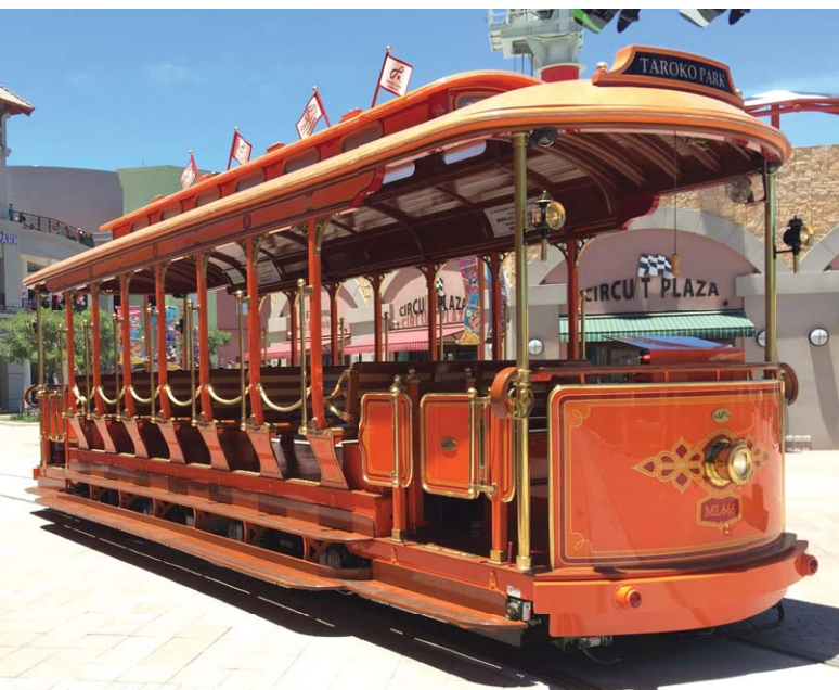
Taroko Park trolley car #ML666, Kaohsiung, Taiwan.

We aim to improve the quality, safety, and reliability of the cars through the adaptation of modern manufacturing methods and additional technology.