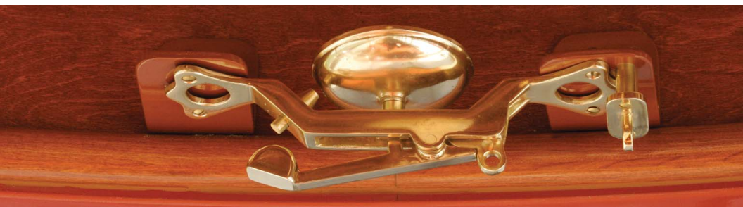
Solid brass conductor bell