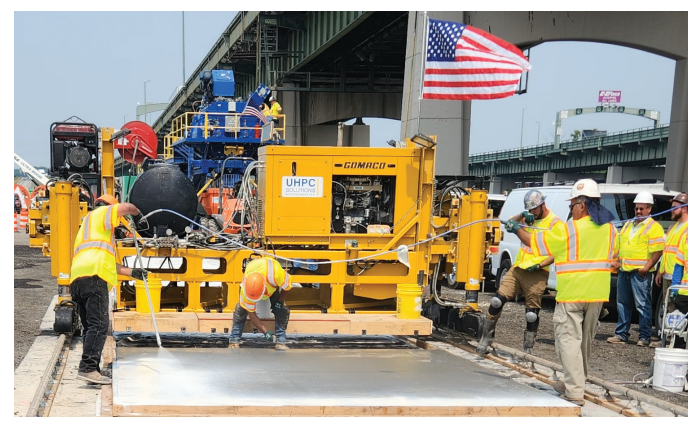
The GOMACO UHPC paver demonstrated its capabilities at the 2023 International Symposium on Ultra-High Performance Concrete in Wilmington, Delaware.