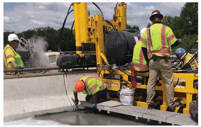
Zero-clearance UHPC paving can be accomplished with the ability to position the legs of the paver where they need to be.